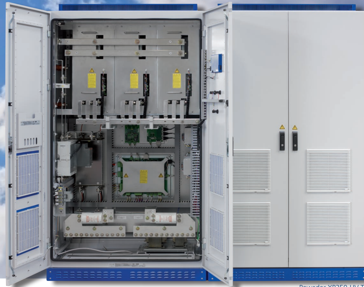
Powador XP350-HV TL