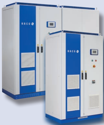
Powador XP100-HV Powador XP350-HV TL